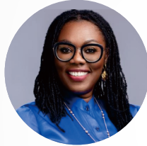
Hon. Ursula Owusu-Ekuful Minister for Communication